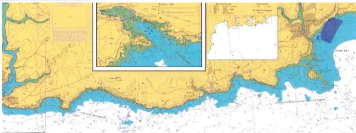
Location 1: Looe Bay

Tuesday 23 rd April 2024 surveys of the Seagrass beds in Looe will be taking place by Plymouth University Divers in one of the sites specified below.